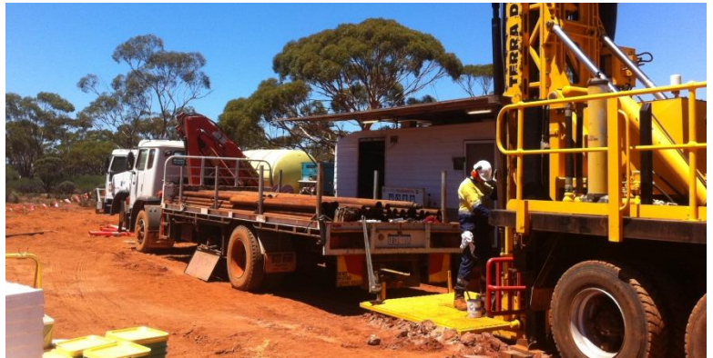
Figure 1. Diamond Rig at Mt Vettters

The steel casing of drill hole PRC1 has now been completed and a diamond tail from 100 metres to 350 metres commenced at 1pm WST on the 7th February 2013 (the diamond rig is shown in Figure 1). This follows earlier RC drilling from surface. The diamond tail will provide a more accurate sample as well as a better understanding of the geology of the potential footwall sequence of the BSKC (refer to Figure 2).